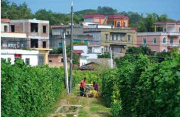
Agriculture is increasingly the domain of the older generation in the hills of eastern Guangdong, China.