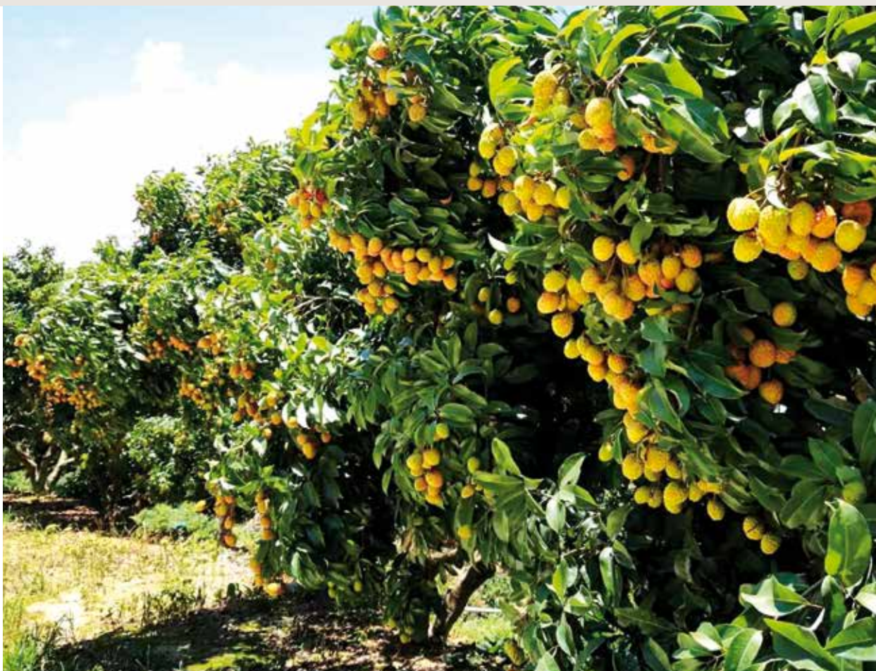
Fruit farm in Zengcheng, in the periurban belt east of Guangzhou. While the urban market is significant, the capital investment is high.

what little is left is invested in consumer goods.