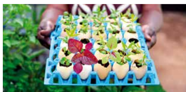
Amaranth and pomegranate seedlings in eggshells