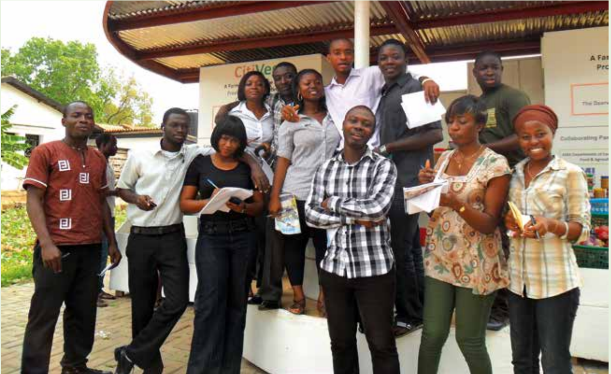
The CityVeg project supported direct selling by young farmers in Accra.

the percentage of Africans going abroad is increasing as well: half of the travel is to neighbouring countries and the other half to destinations further away. Within Africa this leads, for instance, to migration to South Africa. As well, intercontinental migration has recently increased, with Europe still dominating but Asia growing in importance. Currently, intercontinental migration from Africa as a whole is in the range of one per cent of its population. With increasing wealth this could grow to what can be seen as the world average for intercontinental migration: between two and three per cent. In absolute numbers this is a change from the 12 million Africans currently elsewhere to more than 50 million in 2050. In relative terms, however, the intra-African migration of Africa's youth is and will remain much more significant.