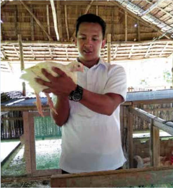
Poultry production at Catbalogan City Agro-Industrial School.

the food chain could be framed differently for youth and recognised as a vital part of society. To confront perceptions and realities about agriculture, including the stigma of food production as “backwards” and unprofitable, youth are enabled to value traditional food and shown how its cultivation positively impacts urban centres (page 38).