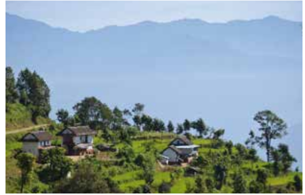
Today, livelihoods in the Chirkhuwa valley in Nepal's Bhojpur district are heavily dependent on remittances.