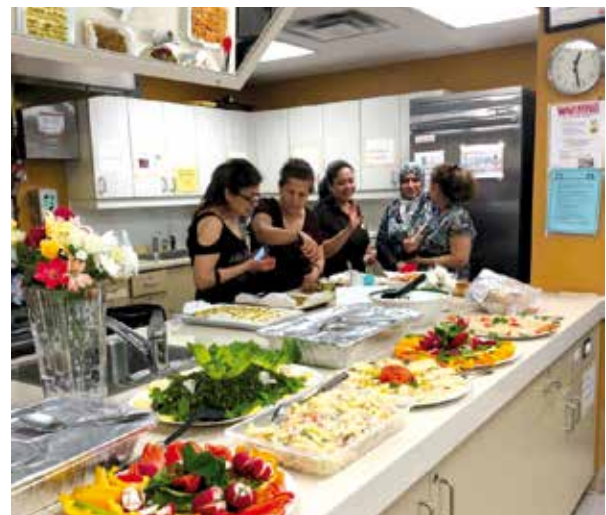
Peer leaders display their cooking talents during the visit of a Greek delegation.

CFW uses a health equity lens which focuses on addressing the underlying causes of differences in the quality of health and healthcare across different populations. CFW collaborates with community agencies that work with marginalised communities, including those working with at-risk youth. As well, CFW addresses long-standing barriers that low-income individuals face, such as travelling to a course location and paying training fees, in accessing food