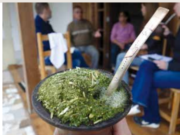
In southern Brazil, Chimarrão is the traditional way of serving and drinking erva-mate; its roots lie in indigenous Guarani culture.

What is becoming clear in our work to document and share knowledge about traditional erva-mate production in southern Brazil is that recording, sharing and valuing these practices is an important first step in changing the way