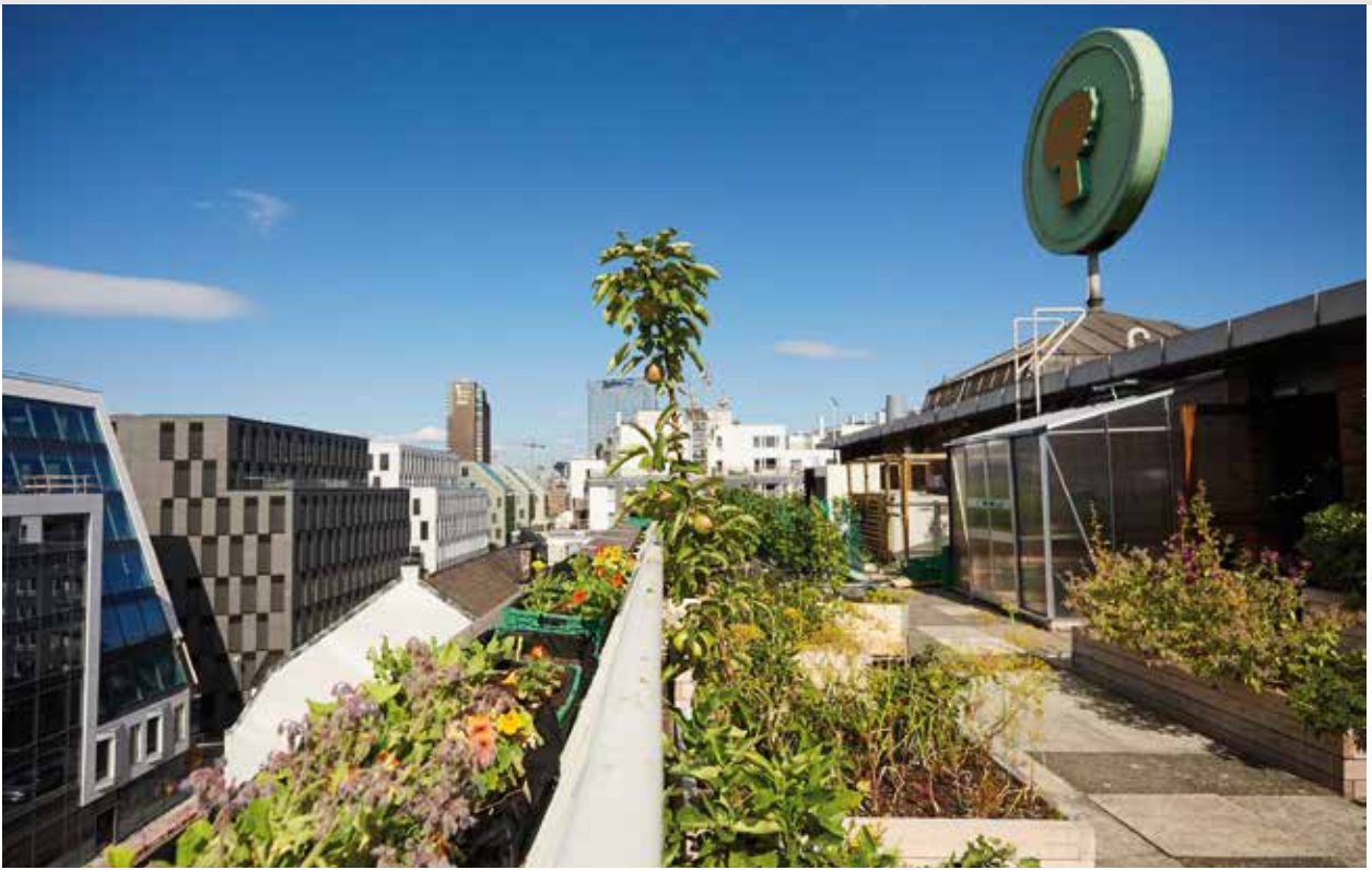
A view of the garden looking west.

diverse group, spanning many decades of immigration and many cultural and religious backgrounds, with Somalis, Pakistanis and Iraqis making up the largest groups of non-western immigrants.