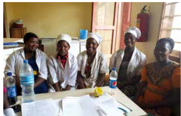
Group discussion with young women who are members of dairy cooperative MVIVAMBO.