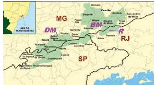
Figure 1: The thirty municipalities that constitute the Mantiqueira EPA (in green), an environmental hotspot measuring 4,480 km 2 .

The project is being implemented in six pilot schools located in three out of thirty municipalities that constitute the Federal Environment Protection Area (EPA) of Mantiqueira