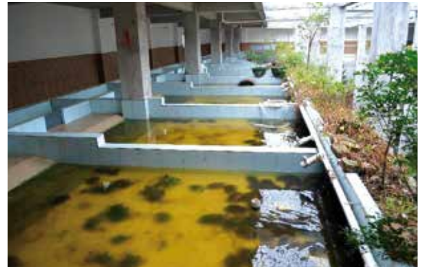
Niche enterprises serving the city markets, such as turtle farming, can offer significant profits to youth across China.

Again though, the capital investment is likely to be prohibitive for poorer migrants.