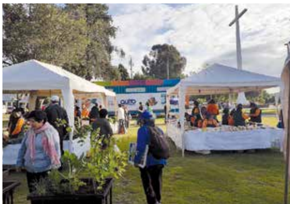
La Carolina Bioferia on a busy Saturday morning.

In Quito, the UA project AGRUPAR is led by the Economic Development Agency CONQUITO. The goals of the project are to increase food security and sovereignty, promote social inclusion, increase income and employment, and provide