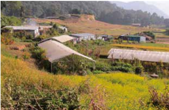
Commercial floriculture is one of the many higher-value agro-enterprises engaged in by migrants to the Kathmandu valley in Nepal.