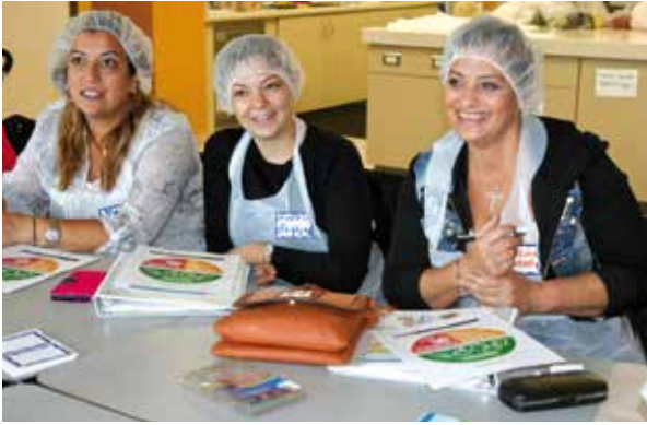
In-class learning session with Arabic language materials.

is key for addressing basic income needs and food security; all of these are important for health. As a result, addressing challenges to entering the Canadian labour market has the potential to minimise the risk of poor health among newcomers in the City of Toronto, and provide financial, social, and psychological benefits (Toronto Public Health and Access Alliance Multicultural Health and Community Services, 2011). By providing newcomer participants with food handler training and certification, CFWN supports their employability. In the first year, 208 participants graduated from the programme, and these graduates are either employed or are ready to access employment in the food sector. CFWN is currently being evaluated. This process requires a six-month follow-up survey of participants after completion of the training. The final evaluation, which includes employment outcomes, will be available in March 2019.