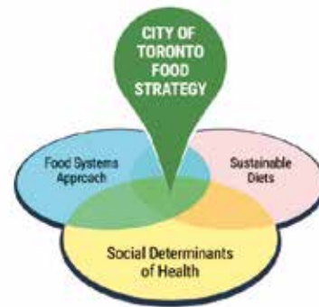
Figure 1: City of Toronto Food Strategy Approach

In 2011, Community Food Works (CFW) was initiated by the Toronto Food Strategy as a pilot project to provide an