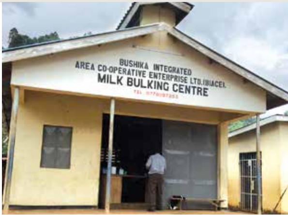
A milk bulking centre of dairy cooperative BIACE in Uganda.

is ageing. However, it is still common for agricultural cooperatives to be dominated, managed and led by older men. Also, young people, and young women in particular, are scarcely involved in key decision-making processes.