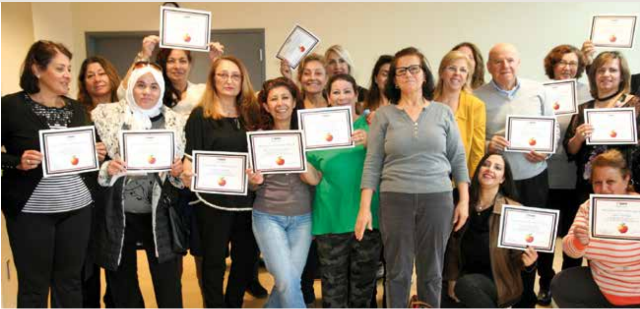
Class graduation.

handler training and nutrition information. As a result, CFW has been delivered successfully in partnership with a wide variety of city divisions and community agencies in neighbourhoods across Toronto.