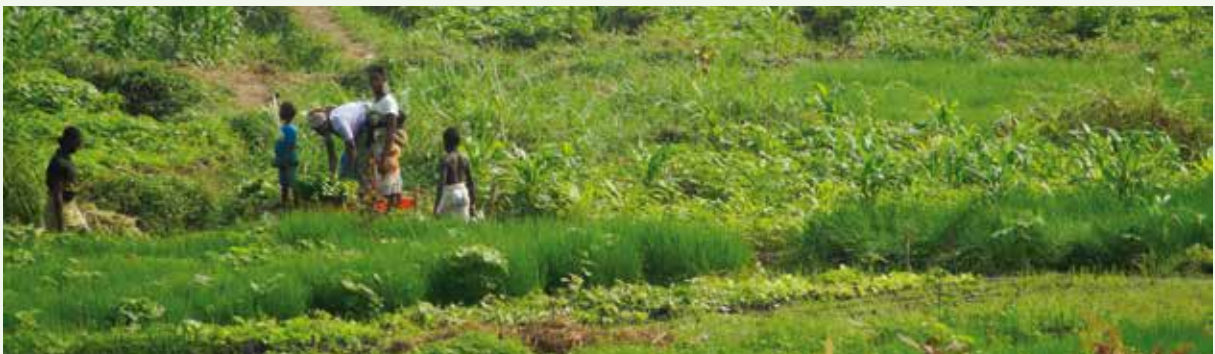
View of a Kenema urban agriculture site where many of the cultivators are young people.

These testimonies illustrate the opportunity that urban agriculture provides to young people who have no skills or qualification other than what they have learned on their parents' farms and what they may have practised before the circumstances of war overtook them. These three examples were picked from a sample of 250 young farmers in Kenema city.